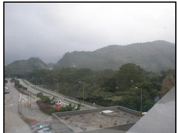
View from my window

The project I am working on is the Main Hong Kong Terminus (West Kowloon Terminus) for the 26 km High Speed Rail link to China. It has generated a lot of protests in Hong Kong recently because of its high cost. But if it is viewed in the bigger picture, it should benefit Hong Kong in the long run because the link will connect Hong Kong to a High Speed Rail network (of 10,600 km) in China. When it is completed, Hong Kong to Beijing will only take 10 hours.