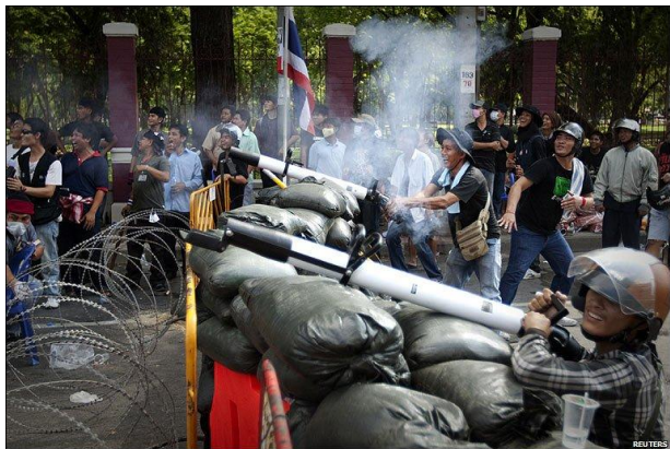
Political Trouble in Thailand

I praise and thank God for you guys for taking up leadership to continue the work in West Europe. Although I am based in Hong Kong, you are still very much in my heart and my prayers. I hope I can still join the Hope Fest and ELC in future. It is of course up to the HIM Eldership to decide when I relinquish my role as Regional Pastor for HWE.