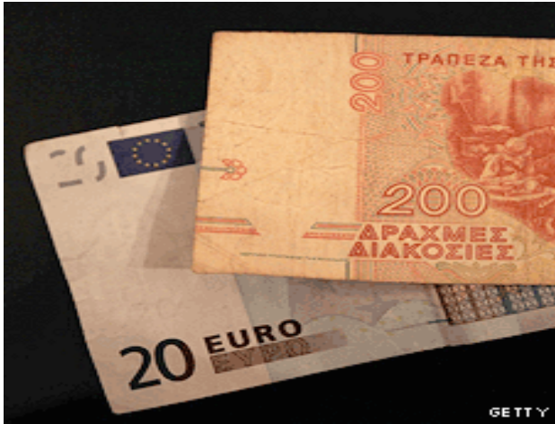
Financial Trouble in Europe