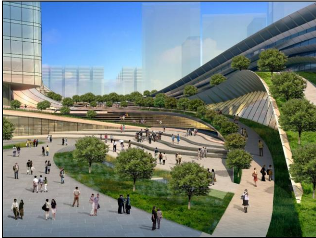
Civic Plaza (View 1)

One day God came to my aid. The Landscape Designers presented the design of the Civic Plaza - a key landscape feature of the Terminus Building to the Client. The Client was very pleased with the design. The Architect Discipline Leader's boss was also present. I quietly thank God for the good result.