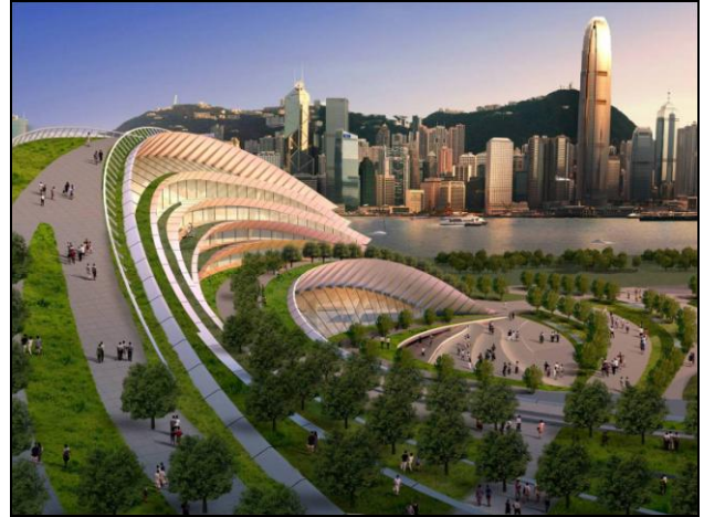
Civic Plaza (View 2)

Then something amazing followed. After the presentation, a junior architect gave me a drawing of the Civic Plaza and told me that the Architect team have forgotten to allow for 7 parking spaces required by the Fire Services Department in case of a fire. This requirement would mess up the Civic Plaza design just presented to the Client. I showed that drawing to the ADL's boss and he was furious.