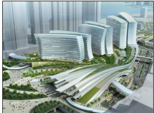
Overview of Terminus with Above Station Property Development

I have shared a bit about the challenges I was facing on Day 1: