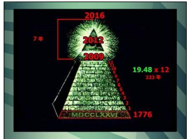
7 Year Tribulation (The Pyramid on the US Dollar)

A few smaller churches (all around 50 people) I have visited are basically trying their best to take care of the congregation like a family, with no particular vision or direction.