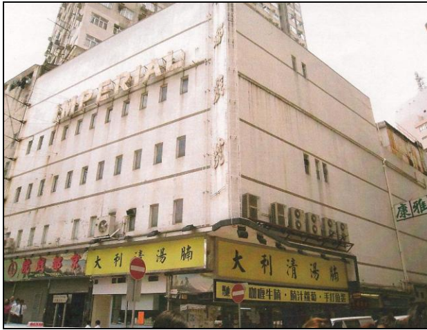
The Vine (Before)