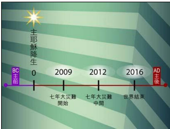
7 Year Tribulation Timeline

The pastor is preparing his congregation for the final battle!