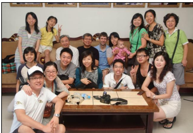
Group Photo of Leaders

I had a great time attending the Church Retreat of a Shenzhen Church on the 1 st , 2 nd and 3 rd Oct.. I had very good feedback on my sharing. I will continue to work with the pastor as I can see my church planting experience can really help him and the church.