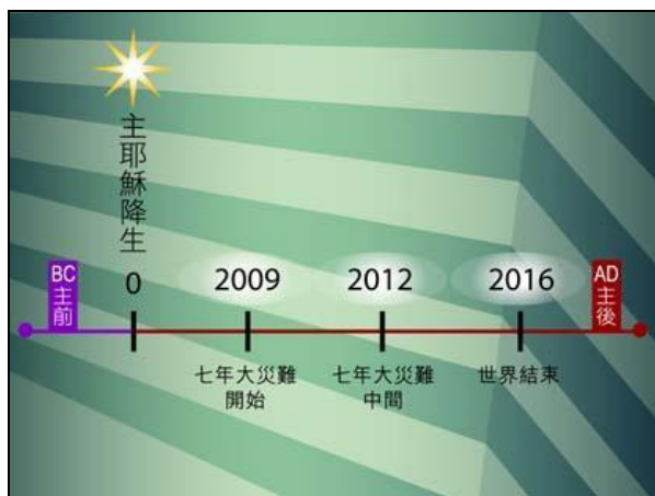
7 Year Tribulation Timeline

The pastor was preparing his congregation for the final battle!