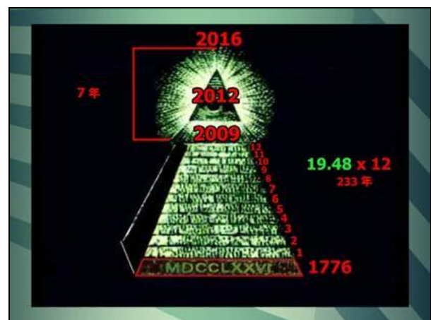
7 Year Tribulation (The Pyramid on the US Dollar)