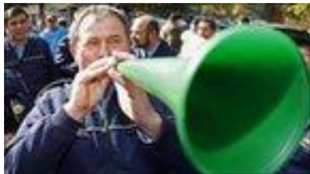
Irish protest 2

The enlargement of the European Union was based on the premises of a united and stronger Europe. But the ripple of the near collapse of the banks of 2 years ago is becoming a tsunami for a few weaker economies which were built on inflated property markets.