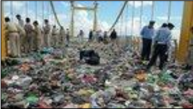
Scene of the bridge