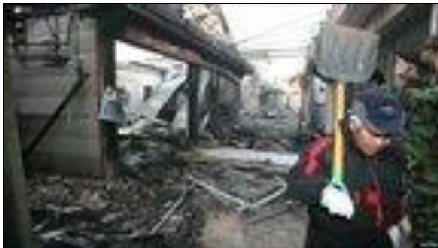
The aftermath – damaged houses