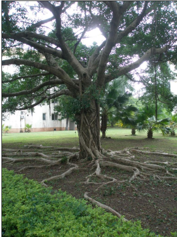
A strong tree with a strong foundation

It is a posture of readiness. There is nothing that prepares us better than to know the Word of God well and remain steadfast in our faith in a time of turmoil.