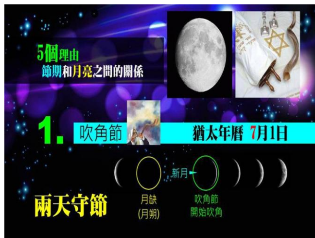
New Moon marks the New Year's Day

Each year, the priests would blow the trumpets on the 1 st Day of July (of the Jewish Calendar) to mark the Jewish New Year's Day, preparing the people for the Day of Atonement on the 10 th Day.