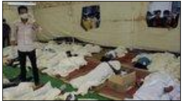
People killed in the stampede

What was supposedly a jubilant occasion celebrating the Water Festival in Cambodia has ended in great tragedy. After the joyful celebration, some 7000 to 8000 of revelers on the way home were trapped in a bridge that was probably not designed/checked for such exceptional overloading. The crowd began to panic when the suspension bridge began to sway. Fear of collapse gripped the crowd, creating a stampede that resulted in the loss of hundreds of lives when they stepped on one another to escape.