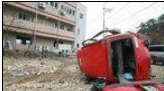
The aftermath – damaged vehicle

Some quarters are saying this is North Korea's way of show of power when they prepare for leadership succession. The young Kim was recently made the 2 nd most powerful man, despite of his relative lack of standing in the army. The aging father needs to do something to shore up the son's status, preparing for the inevitable.