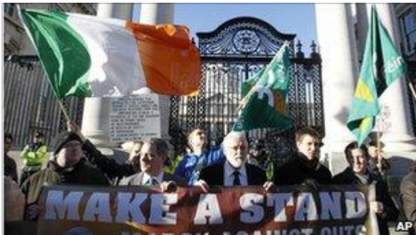
Irish protest 1