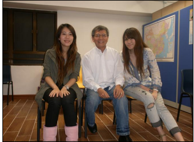
God gave the increase

One Saturday, no one turned up at 4:00pm. At 4:15pm, still no one turned up. This is when most people would decide to pack their bags and give church planting a miss. ☺