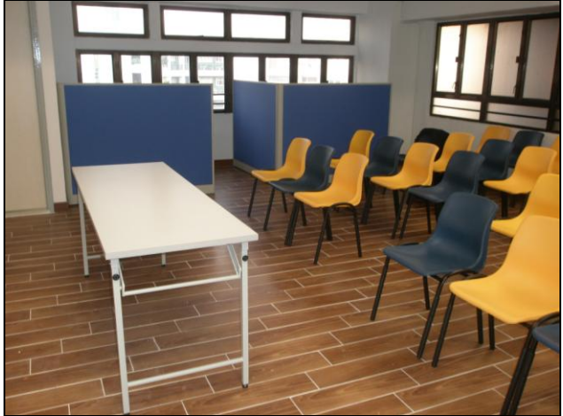
BBC School - Inside

When you are one person, you do EVERYTHING: