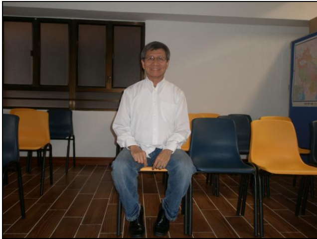
I was One