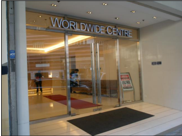
BBC School @ Worldwide Centre

When one has been church planting for 12 years like myself, one tends to forget what it was like in the beginning!