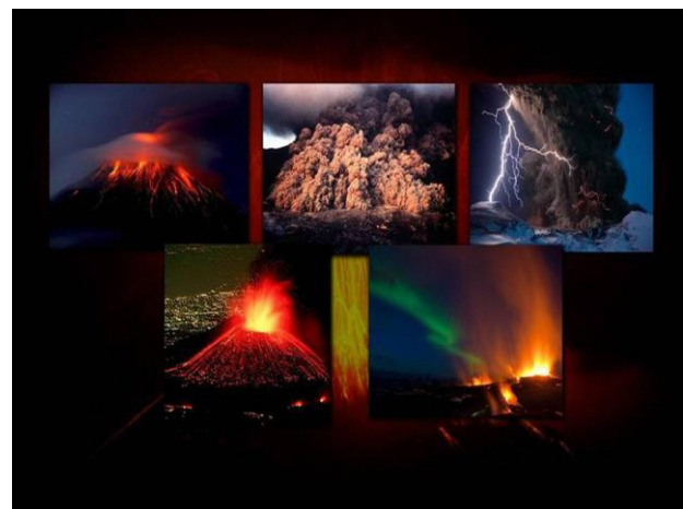
Famines and Earthquakes