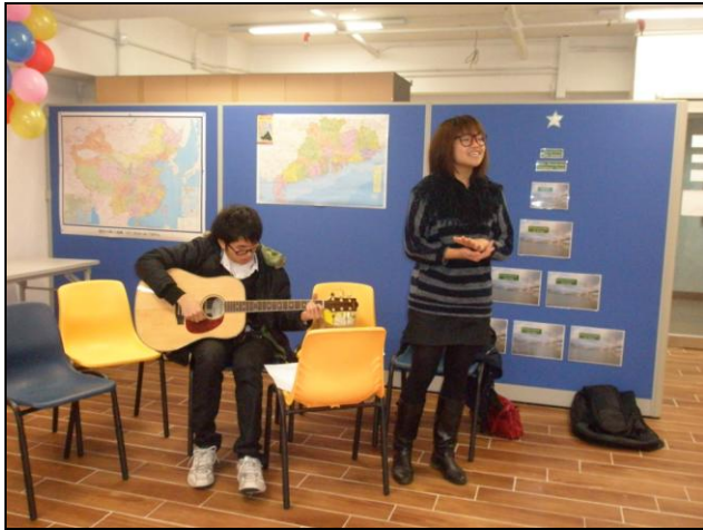
P&W @ BBC