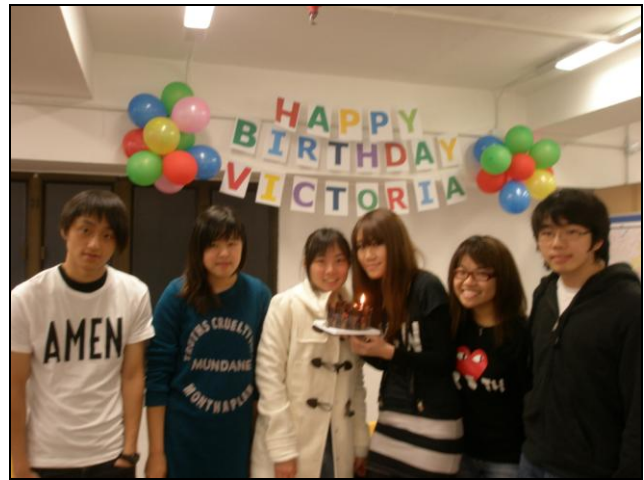
Birthday Celebration @ BBC

Since their departure at the end of February, God, through a friend, provided us with a software that enabled us to have P&W without musicians. The songs are played from the computer and projected onto a screen like Karaoke. ☺