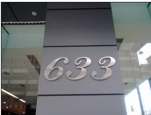
633 King's Road

Since the completion of my 6-month contract working on the iconic Main Terminus for the High Speed Rail project in Hong Kong at the end of August last year, I started looking for another job. I had to wait 4 months before God finally opened a door at the start of the New Year. Looking back, I can see that God used the waiting period to allow me to set up the BBC School. His plan and timing are perfect. ☺