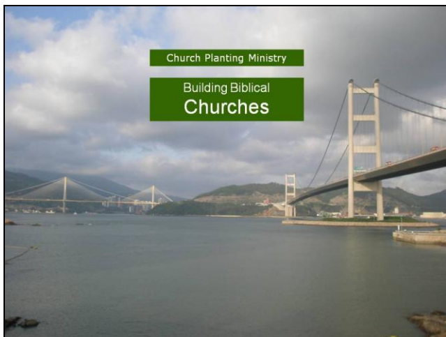
Building Biblical Churches

In my last newsletter, I shared about the launch of the BBC School [BBC = Building Biblical Churches (church ministry) and Building Bridges for Christ (marketplace ministry)]. By God's grace, both ministries are off to a good start.