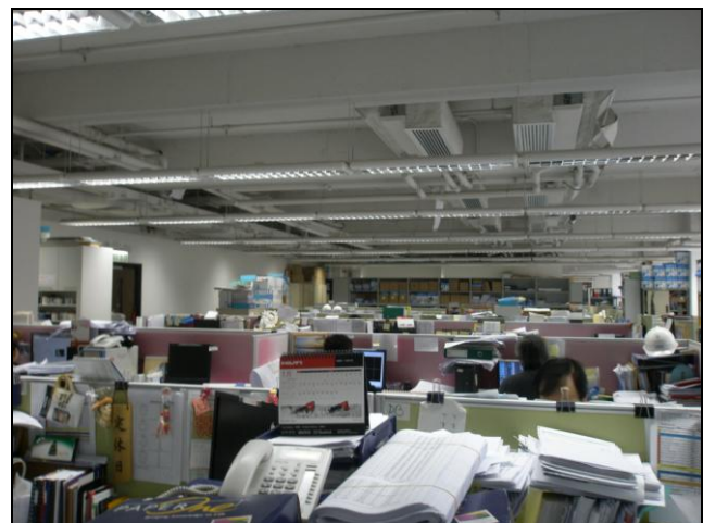
Inside The Office